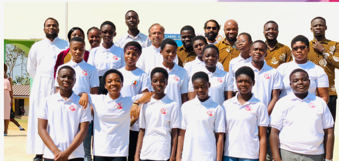
The Pioneer Batch of CMI Carmel School